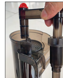
Installation and removal of the inlet and outlet tubes.