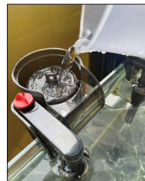
Fill the filter body with treated aquarium water before connecting power.