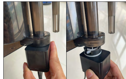
Installation and removal of the filter pump.