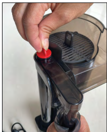
Water flow adjustment valve