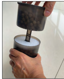
Disassembly and assembly of the filter media baskets