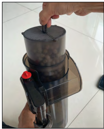
Removal and Installation of the Filter Media Baskets.