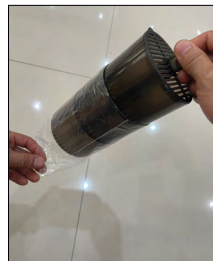
Before first use, remove the plastic overwrap from the filter basket and media, then return it to the filter body.